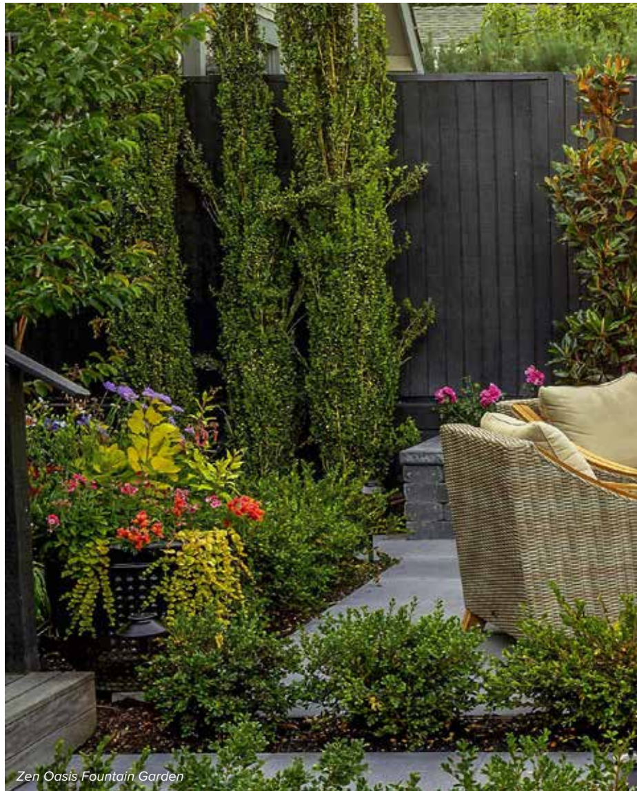
Zen Oasis Fountain Garden

Design an outdoor living experience that reflects your lifestyle and embraces the natural beauty of the Pacific Northwest.