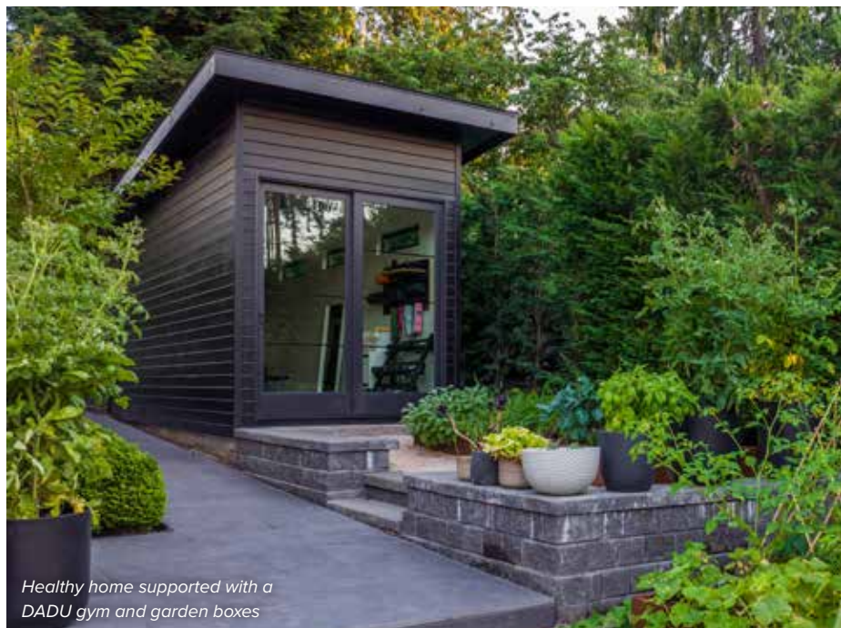
Healthy home supported with a DADU gym and garden boxes