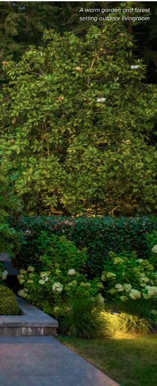
A warm garden and forest setting outdoor livingroom